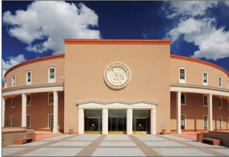
New Mexico State Capitol in Santa Fe.

2023, being an odd-numbered year, was a 60-day legislative session. Of the 1,000+ bills introduced, 220 bills passed both the house and the senate. Animal Protection Voters of New Mexico (APVNM), the statewide advocate for animal-friendly legislation in Santa Fe, designated two animal-related bills as “priorities,” Senate Bill 215 and SB 271. Both passed the two legislative bodies and were signed by Governor Lujan Grisham on March 30. Here’s a summary of APVNM’s priorities and other animal-friendly legislation this session.